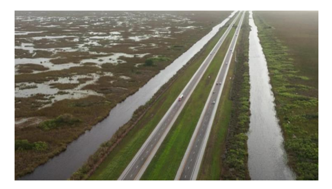
Fig. (1). Aerial view of long, straight, 4-lane divided highway with canals running parallel on both sides.

To increase safety and address growing traffic volumes, several upgrades were made. By 1992 Alligator Alley was a 4-lane divided highway. Notably, drainage canals (up to 12 m deep) ran parallel to both sides of the highway. A minimum clear zone of 18.3 m formed a spatial barrier between the road and canals to decrease the likelihood of vehicles reaching and entering the water [31] (Fig. 1). Additionally, chain-link wildlife fencing (FDOT Standard Type A and B) along the canals restricted animal access to the roads.