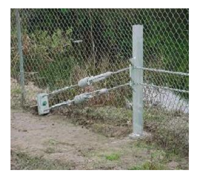
Fig. (3). Heavy-duty springs that anchor cables at the end of the cable barrier segment.