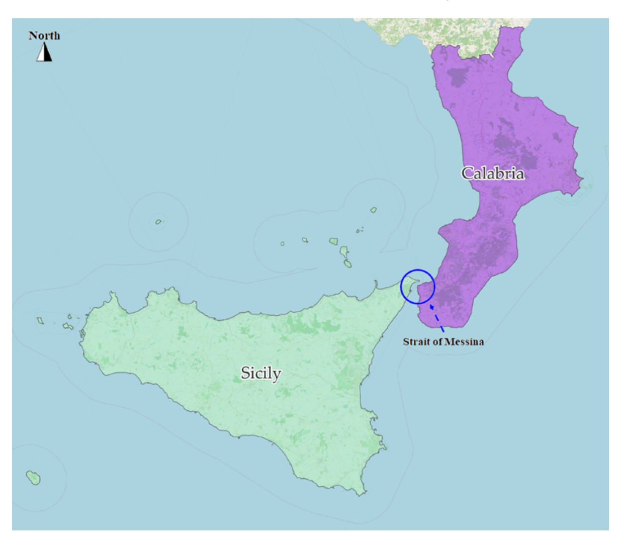
Fig. (1). The Strait of Messina (background map: OpenStreetMap [22]).

Lin et al. [34] explored the impacts of HSR on economic and urban development; the objective is to provide a set of policies to improve HSR services and contribute to economic growth. Fan et al. [35] analyzed how HSR contributed to increasing accessibility (also causes economic growth). Other works on this topic [36, 37] explored the role of HSR in regional economic disparity. The introduction of better services reduces the existing mismatch between regional areas and helps economies to develop, thus closing the discrepancy with the wealthiest area of the country [36, 38]. For such a reason, it also represents a way to help the general economic growth of the area and reactivate the productive system [39]. Therefore, the value of time and the reliability of the transportation system are essential factors.