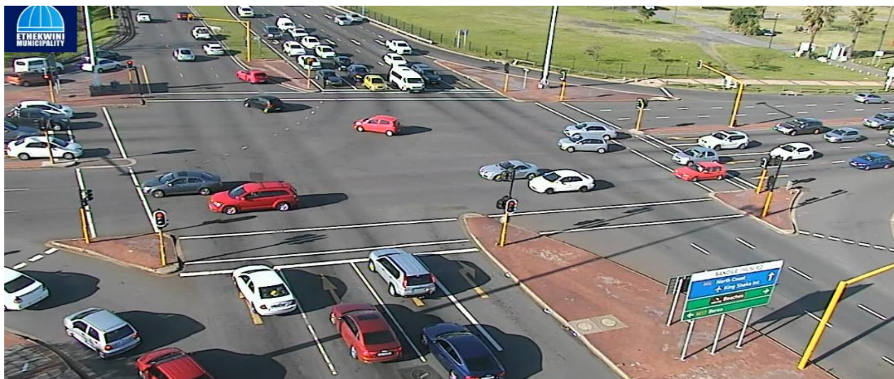
Fig. (1). Typical layout of the study site.

Headway between successive vehicles is an essential microscopic flow characteristic that affects road capacity, level of service, and driver behavior. Average vehicle and discharge headways were extracted manually from the video footage. Recordings were taken for vehicles in the initial queue up to a maximum of 14 vehicles. Time is taken by the first three vehicles to cross the stop line (T3), minus time taken by the thirteen vehicles (T13) divided by the number of vehicles less the first three vehicles at the start of the queue. Discharge headways are then tested for statistical fitness. Estimated discharge headways and their statistical fitness are shown in Table 2. The average value of discharge headways is higher than the median value; the range is from 0.00s to 0.06s, which is consistent with the previous findings [18 - 20]; the skewness of headways is positive. These characteristics indicate that the distribution of discharge headway is likely unsymmetrical, and the normal distribution function is not appropriate to fit the headway data. The lognormal distribution has been found to be the best simple model of the distribution of headways. The fact that the average value of discharge headway is higher than the median value shows that more than 50% of drivers will keep smaller headway, thus suggesting that the saturation flowrate estimation method used probably underestimated the flow rates. Notwithstanding, it will not affect the study outcomes.